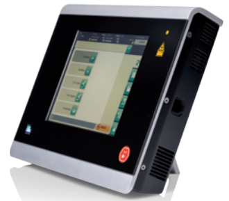
LEONARDO® DUAL 45/100